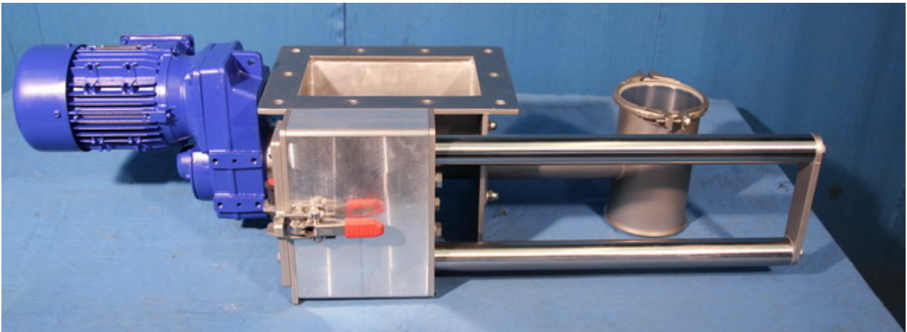
Screw feeder with thread extraction device

So the area in contact with the product can be cleaned easily and thoroughly.